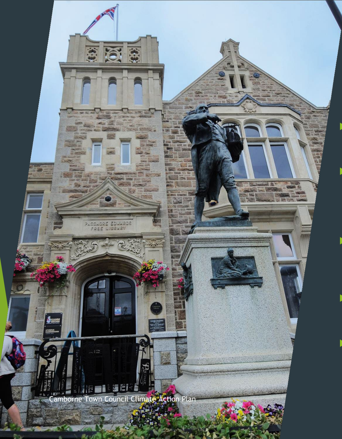
Camborne Town Council Climate Action Plan