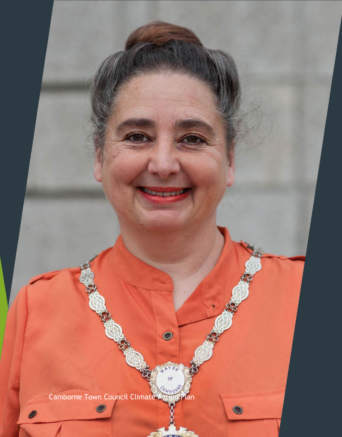
Camborne Town Council Climate Action Plan