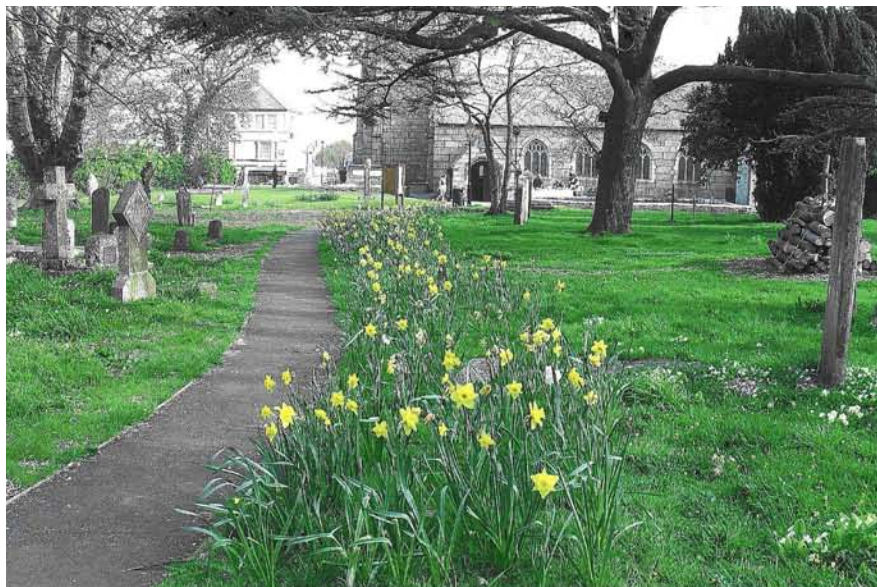
South West in Bloom Award Winner Camborne Churchyard