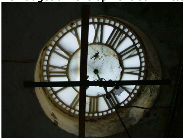
Camborne Town Clock before restoration