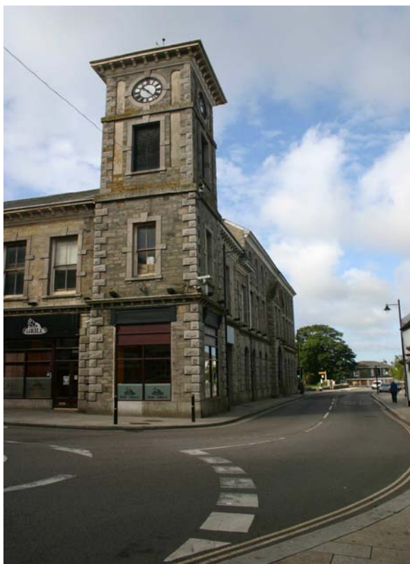
The building previously known as the Corn Exchange