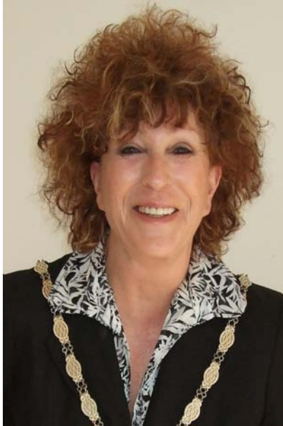
Mayor Jean Charman